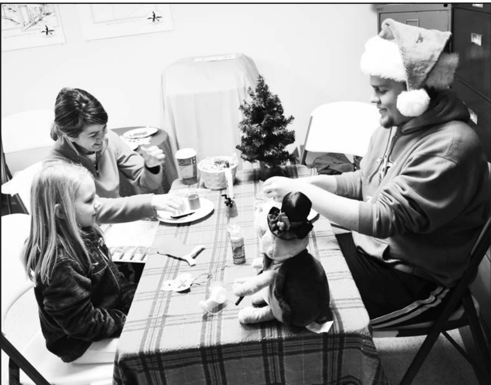
Craftmaking was just part of the fun at the Annual Reece Farm and Heritage Center Open House on Saturday and Sunday.