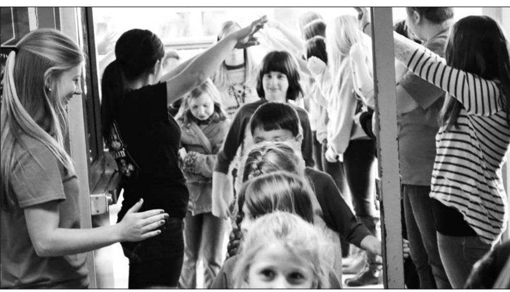
After a morning at Galaxy Bowling, the athletes from Towns and Union County were welcomed at Union County Elementary School.