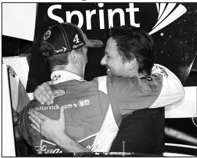
Kevin Harvick hugs car owner Tony Stewart after winning the 2014 Sprint Cup championship.

Gordon was leading the race when a caution came out with 20 laps remaining. Most of the other leaders, along with race-winner Kevin Harvick pitted for four fresh