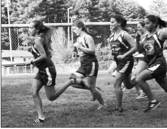
Lady Panthers take off at Meeks Park Meet.