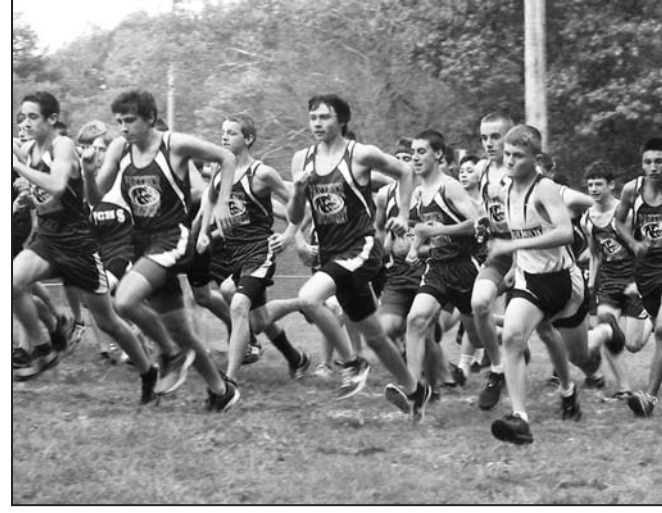
Union looks for a strong start at Meeks Park.