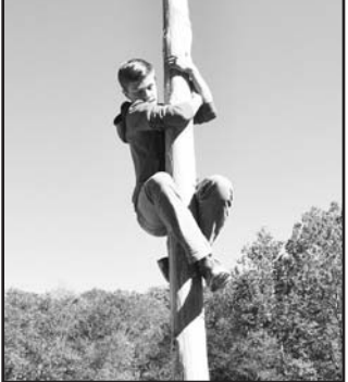
Pole Climbin' winner