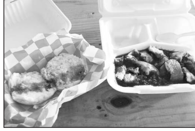
Homemade biscuits with Sorghum Syrup and Chocolate Gravy

The sorghum syrup at the market that Saturday was provided by Freddie Collins