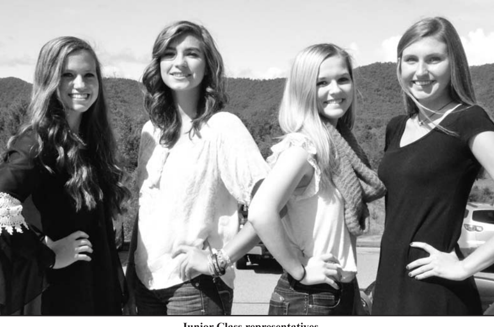
Junior Class representatives