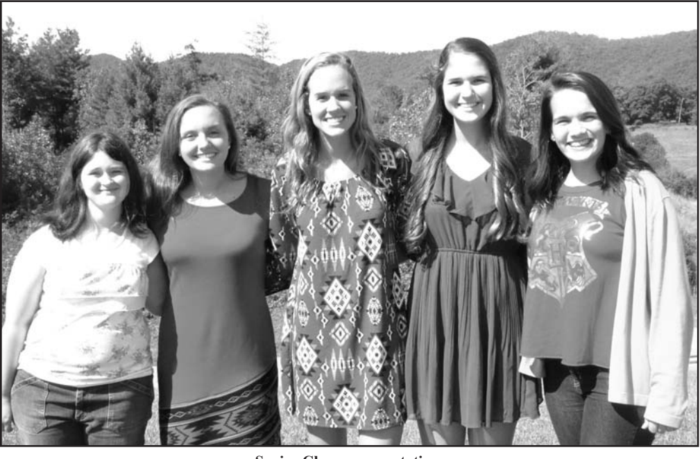
Senior Class representatives