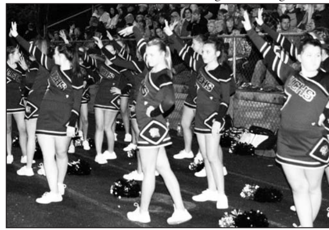
Union's cheerleaders hold four fingers in the air to signal the start of the fourth quarter.