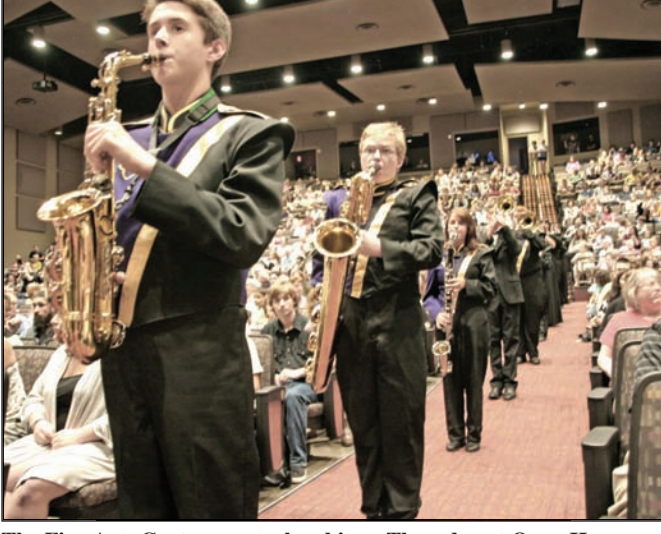
The Fine Arts Center was truly a hit on Thursday at Open House.

"Unlocking the Talent" began, the captivated crowd got to glimpse a spectrum of the new fine arts center's abilities and student talents.