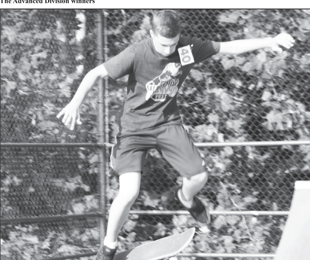
here was plenty of skateboarding talent on display at Meeks Park last weekend.