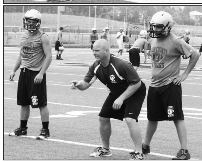
Union County began its conditioning for the 2013 season. The team will travel to Camp Jabez on Wednesday and return Friday. The first official practice will be on Aug. 5th. The Panthers will then host White County in a scrimmage on Aug. 22nd.