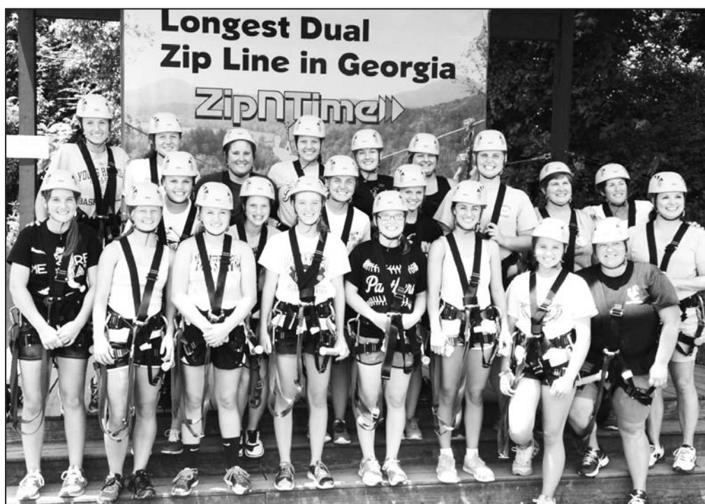
The Union County Lady Panthers went zip-lining in Helen for one of the events of the Panther Pride Camp. The team also visited Helton Creek Falls, went bowling, and camped out in hopes of bringing the teammates closer together.