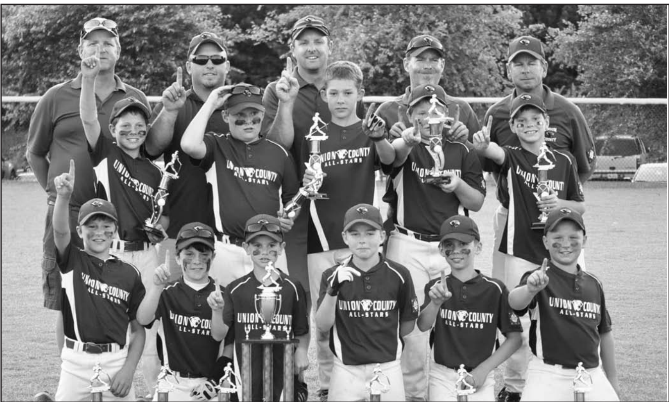
The Union County 10&U Baseball Team after winning the District Tournament last month. The Panthers won two games in the State Tournament in Valdosta last weekend.