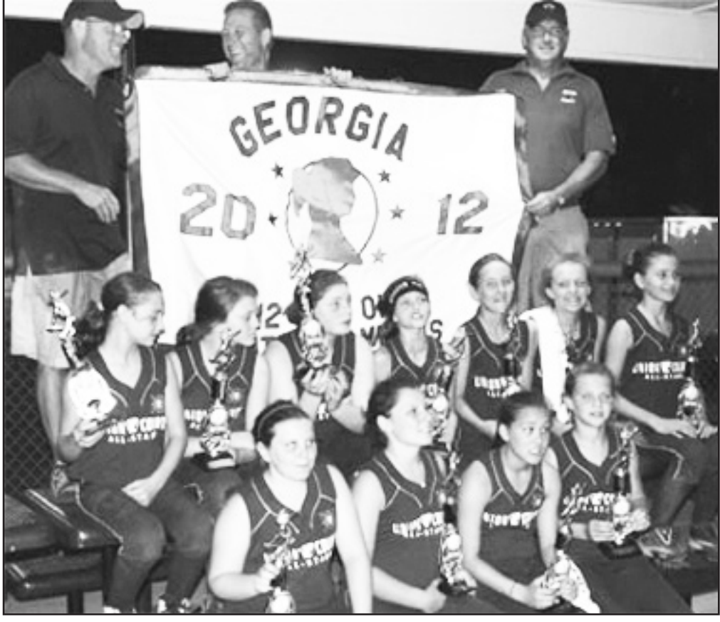
12&U Softball Team following their victory in the State Championship.