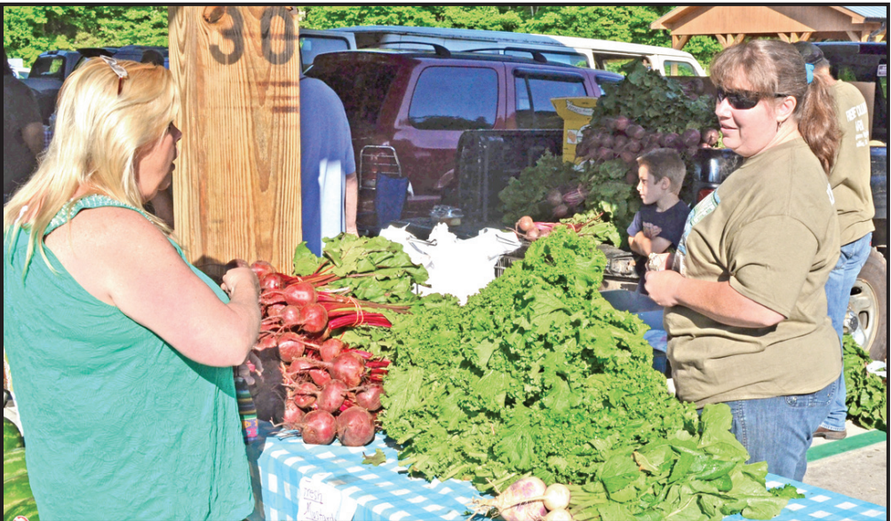
Vendors and customers alike were more than ready to get back into the Farmers Market swing of things on Saturday after nearly seven months since the close of last season