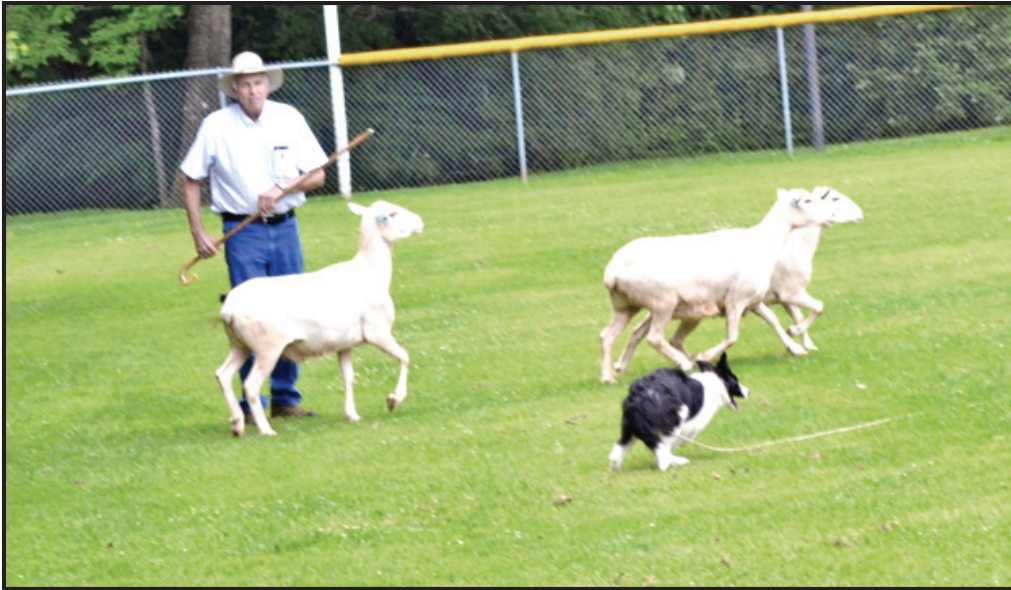
A Border Collie herds sheep during one of the traditional events of the Blairsville Scottish Festival & Highland Games