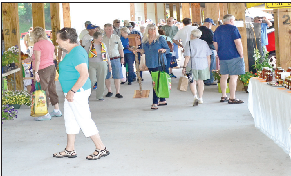
Hundreds and hundreds of patrons visited the Union County Farmers Market during its Opening Day on Saturday, June 4

The Union County Cannery will be open for business on July 5, on Tuesdays and Thursdays from 6 a.m. until noon.