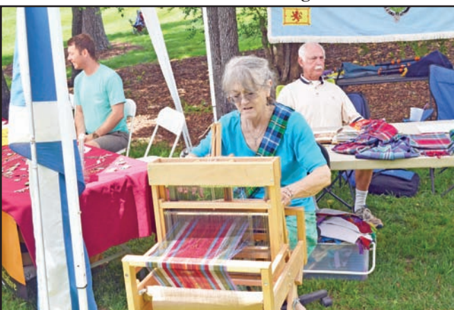
Tartan pride is particularly apparent at the Blairsville Scottish Festival, and the traditional weaving of garments is one of the many draws of the festival each year

family or tribe," according to blairsvillescottishfestival.com. "Each clan has its own tartan which is worn in a kilt or scarf, and members are fiercely loyal to the group."