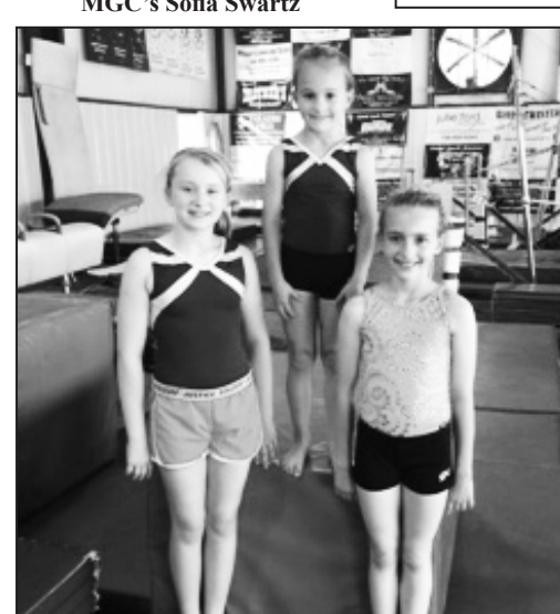
MGC Level 2 and Bronze