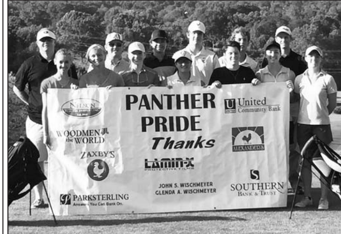
Union County golf thanks its sponsors following the 2016 season.