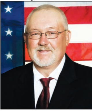
Candidate for Tax Commissioner See page 2A