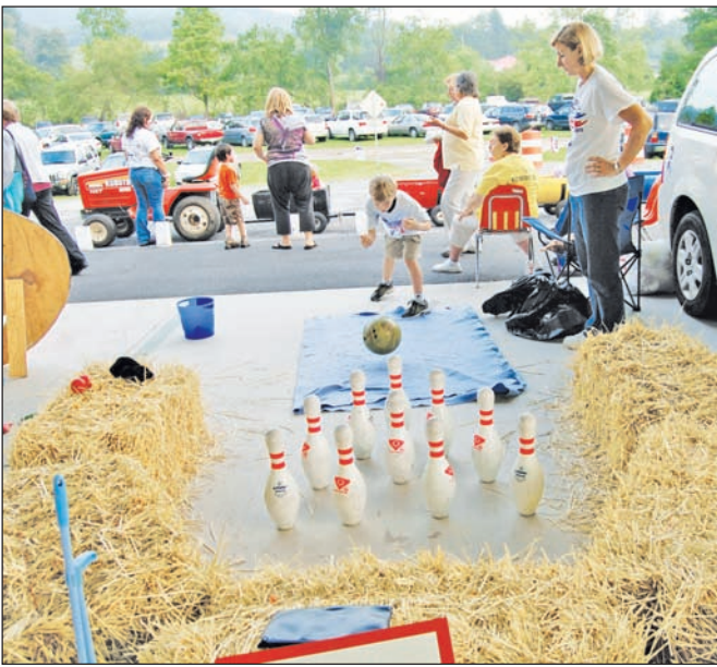
The 2012 Relay For Life rally bowled over the Union County community. Rain didn't dampen local spirits.