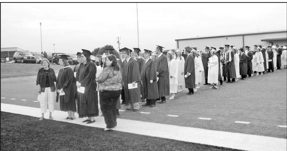
The Class of 2013 is the largest graduating class in the history of Union County High School. There were 161 members of the Class of 2013.