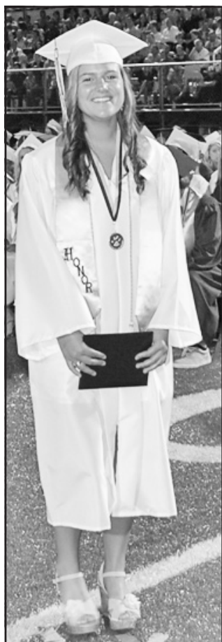
The Class of 2013 was all smiles on Friday at Mike Colwell Memorial Stadium.