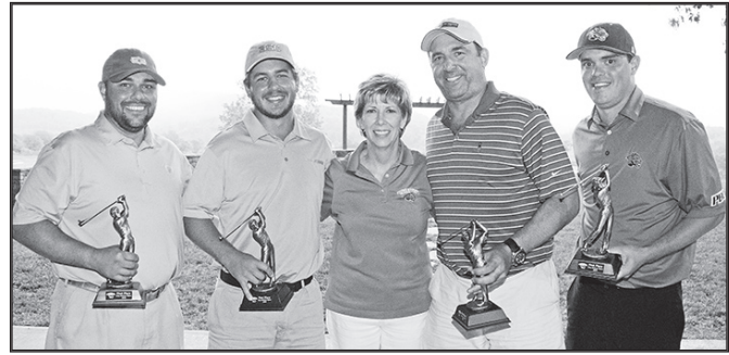
The annual Clay Dotson Open golf tournament to benefit student scholarships at Young Harris College.