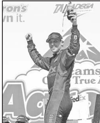
Denny Hamlin gets first Talladega victory

"She has a great sense of humor and very sarcastic and I really appreciate that. Just a ton of fun to be