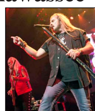
Anderson Music Hall on Friday, June 17 at 7 p.m. Get there

"We're going to sell everything in the building for $70 plus a $2 handling fee, and then everything outside the building is going to be