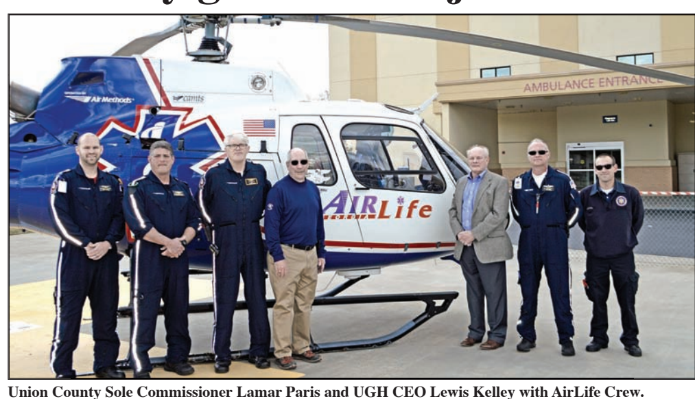
the same coverage purchased by This membership with provide our citizens access to

UGH and Union County government have partnered to provide funding to cover the cost for every individual or family in Union County, and are excited to offer all citizens living in Union County as well as all UGH employees a free Air Methods family membership through Omni Advantage. This membership is not automatic and each household must apply in order for their free membership to be valid.