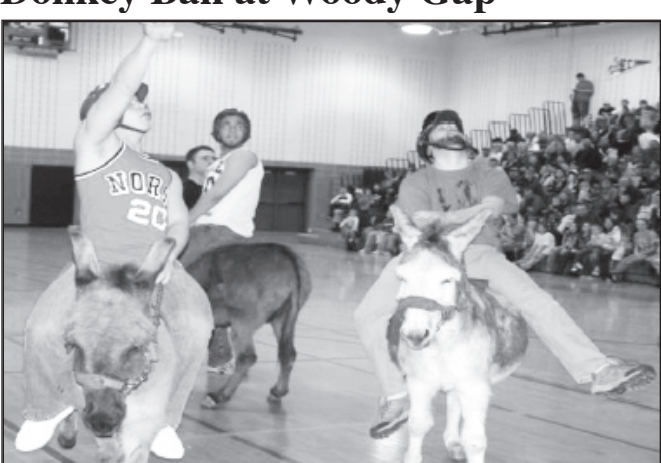
Woody Gap P.T.S.O. and K.I.S.S. Club introduces Donkey Ball! On April 18th at 7 PM, at the Woody Gap Gymnasium. Tickets: adults $8; children $6; and children 5 and under free! Call for more details! 706-747-2005.