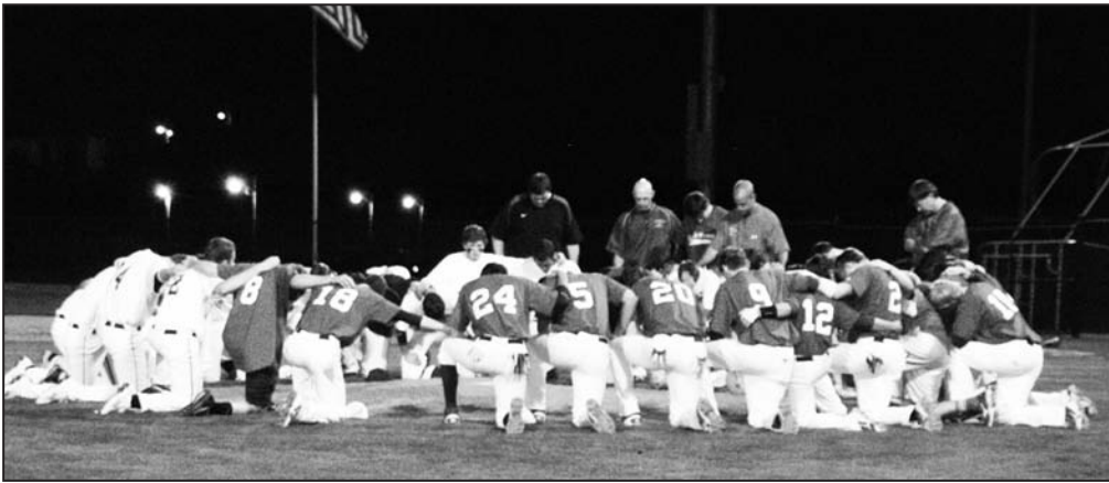
Brothers in arms: With Old Glory waving in the background, both teams take a moment to pray following a 10-inning clash that neither squad deserved to lose.

Literally. The Panther senior countered the Dragons' two-out hit with one of his own, blasting a hanging curve ball over the