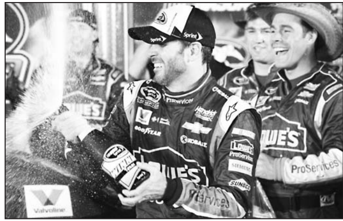
Jimmy Johnson Celebrates His Fifth Texas Cup Win

Jamie McMurray was sixth, followed by Jeff Gordon, Kasey Kahne, Martin Truex, and Carl