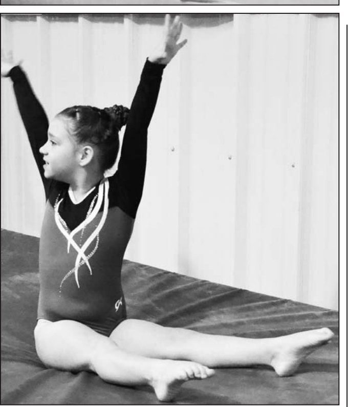
Mountain Gymnastics