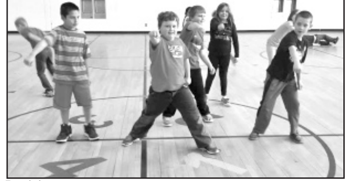
Bustin' some moves

Students were placed in small groups based upon their musical preferences and dancing interests. Some students competed in their own form of break dancing, while others danced their hearts out to their favorite hip-hop or coun-