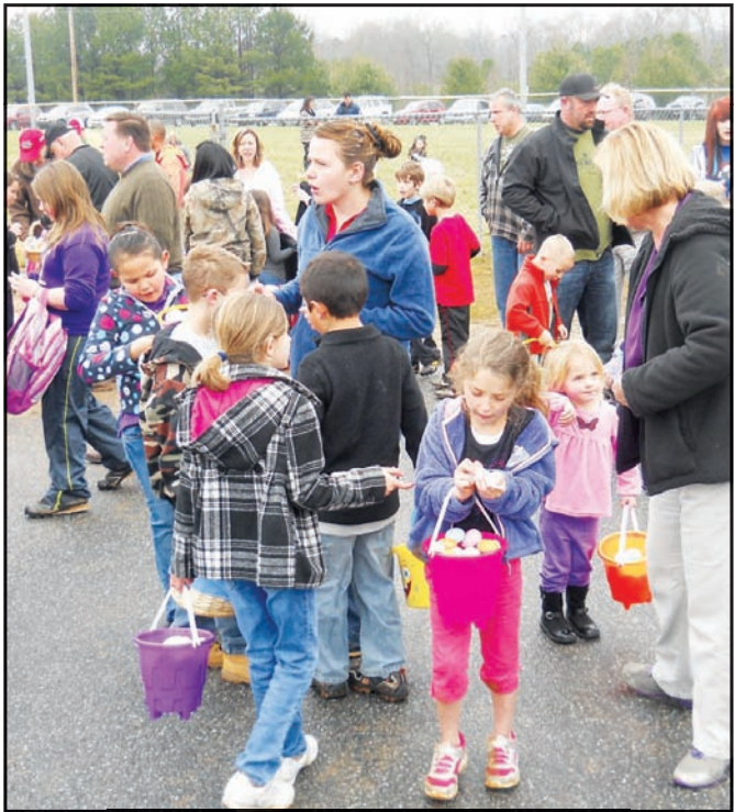
Some excited youngsters proudly display their haul.

the usual helicopter that normally dropped the eggs could not fly because of low cloud cover, but all had a good time.