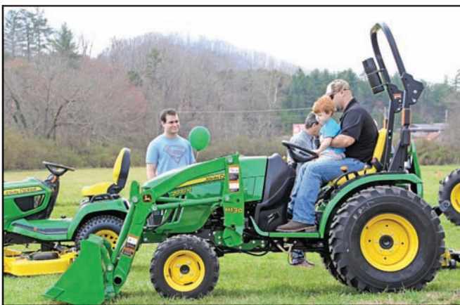
A father watches as his son gets to ride a shiny new John Deere tractor at the Drive Green Event sponsored by Nelson Tractor on Saturday, March 12

Also part of the standing-room-only sale were chickens,