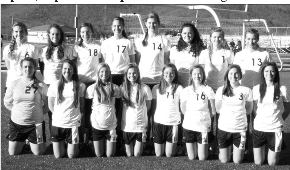
The Union County Lady Panthers look to get back to their winning ways following a loss at Lumpkin County. Union will visit Pickens on Tuesday and host Washington Wilkes on Friday.