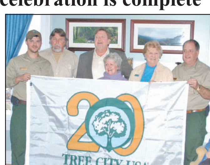
The Georgia Forestry Commission presents Blairsville and Union County with the Tree City USA flag last week at the Mock House.

On Thursday afternoon, the Mock House played host to the gala where the Georgia Forestry Commission was in attendance to say "thank you" to the local commu-