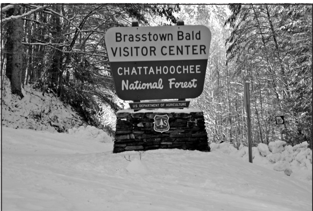
Brasstown Bald Visitor Center gets a visit from Old Man Winter

The Union County Road Department would like to thank Vulcan Materials and the employees who worked late hours and on their days off to keep the salt/gravel mixture readily available for the eight county vehicles that were spreading and plowing constantly over the weekend.