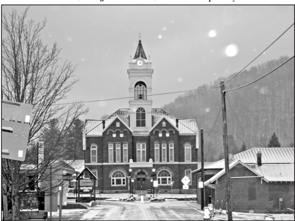
Union County Historic Courthouse as the snow continues to fall