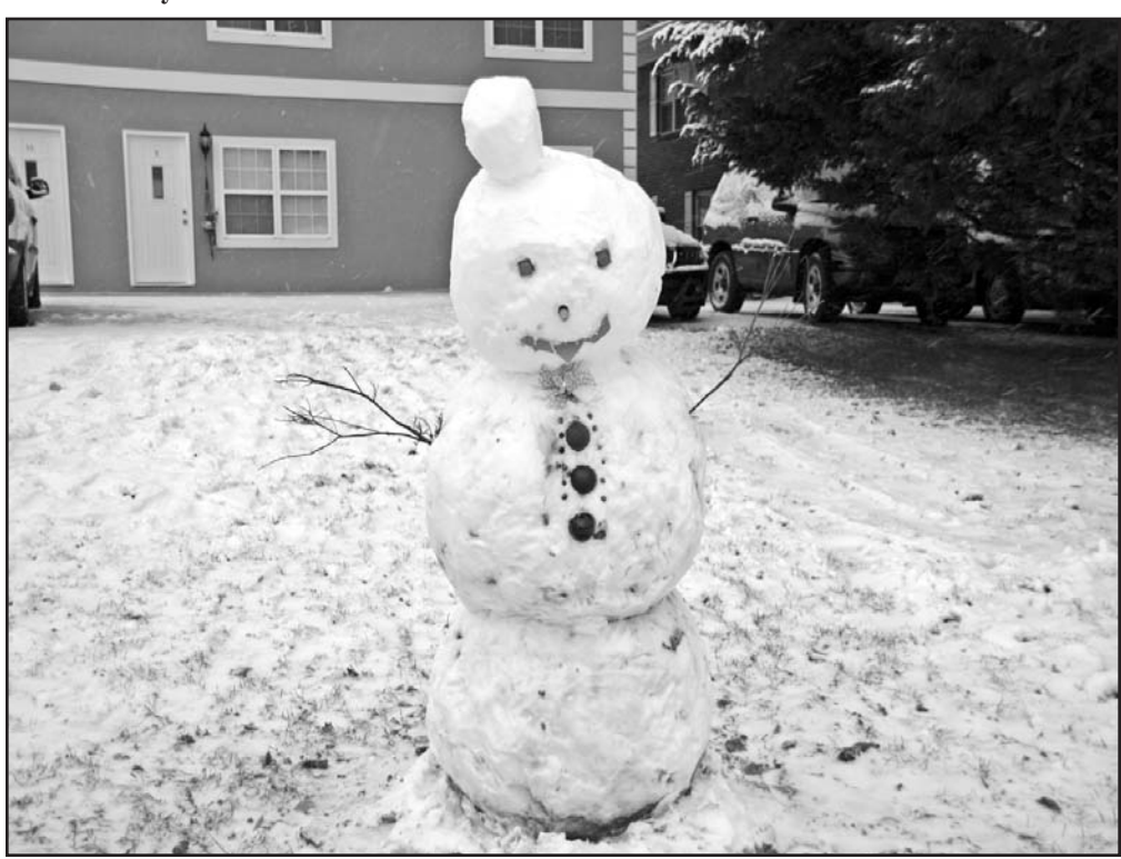
Frosty paid a visit outside Silver Maple Apartments