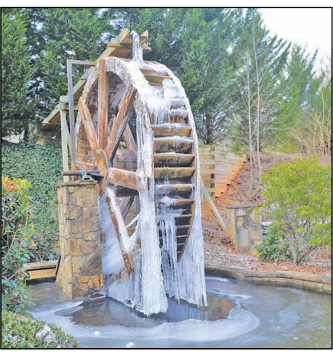
Man it was cold last week at The Ridges in Young Harris. This water wheel looks more like an ice sculpture.

chance of snow comes Friday with predicted 15-degree temperatures, and a high for the day of 35 degrees.