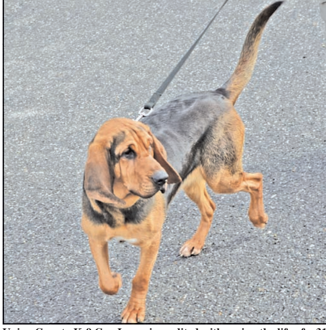
Union County K-9 Cop Lacey is credited with saving the life of a 31-year-old Morganton man.

"A Ford F-150 pickup truck was off the side of the road, and there was an open container of Budweiser in the